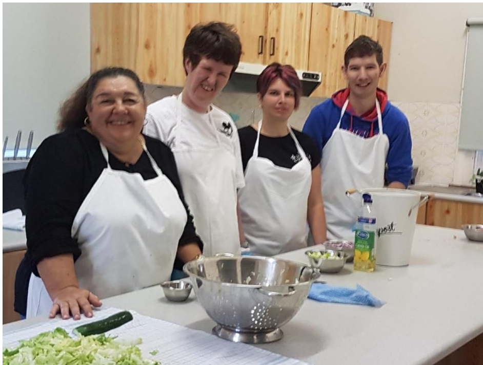
OUR WEDNESDAY COOKING TEAM