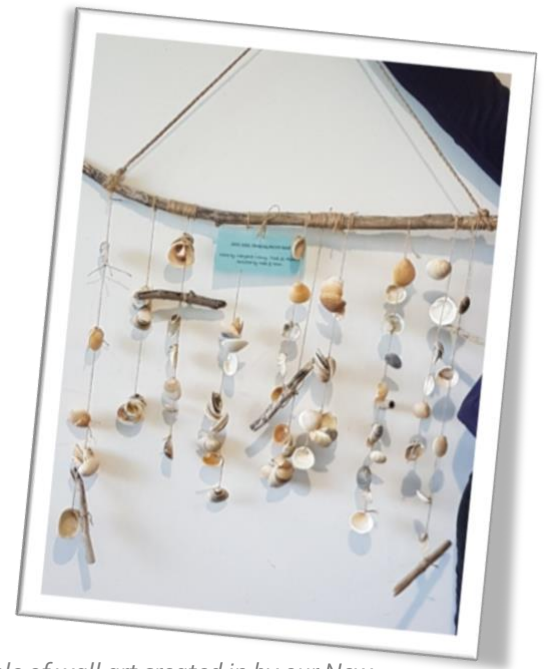
A sample of wall art created in by our New Focus Team .....