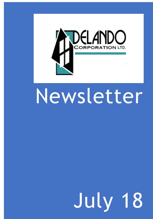
ISSUE NUMBER 06