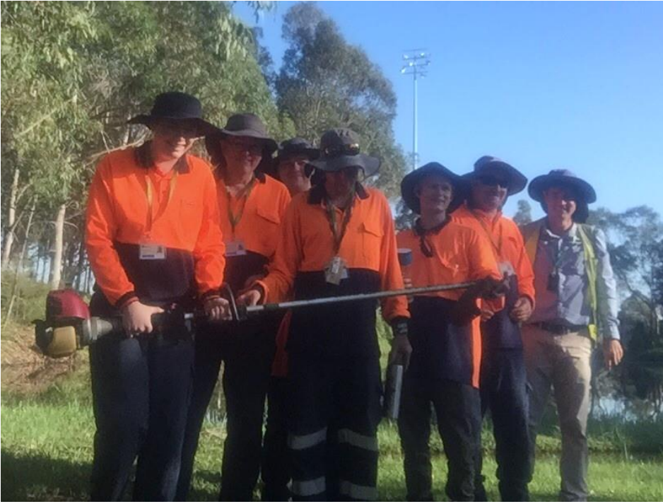
ONE OF OUR UNIVERSITY GROUPS